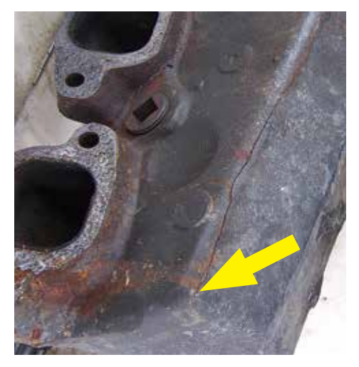
Even a short freeze can cause expanding ice to crack a manifold.

open before adding the antifreeze. In cold weather, it could be difficult to keep the thermostat open. One method is to remove the thermostat, a simple job on most engines. It can be left out for the winter, but don't forget to reinstall it in the spring along with a new gasket.