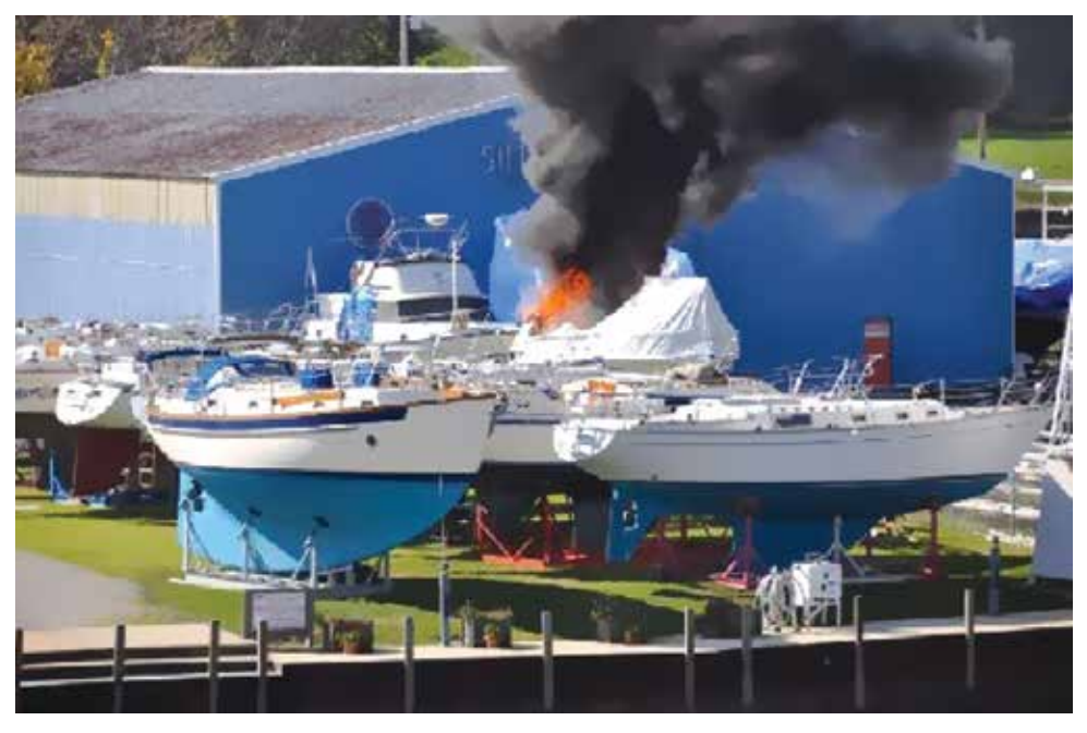
This fire started when an owner unfamiliar with the process tried to shrinkwrap his boat. Shrinkwrapping is a job best left to professionals.

A good well-supported cover offers many benefits. It keeps leaves and debris from clogging scuppers and causing the boat to flood when a downpour comes or the snow melts. It keeps snow from accumulating in the cockpit and forcing the boat underwater