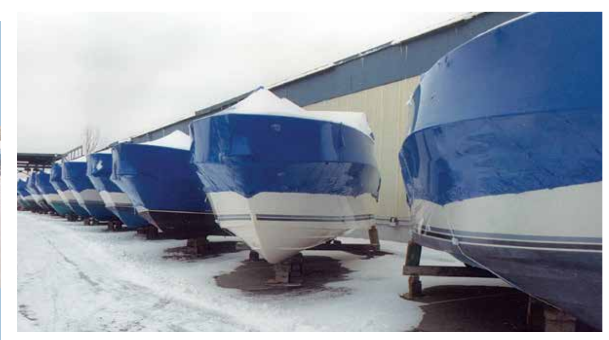
Boats properly stored ashore and winterized are most likely to hit the water without damage and be ready for on-the-water fun come spring.

t's that time of year again. The leaves have started to change color, and the nights are getting longer and cooler. Before the mercury dips below freezing, you need to prepare your boat for the coming winter. At its most basic, winterizing means draining any water aboard or replacing it with enough of the right kind of antifreeze to protect against the lowest temperatures your boat might experience.