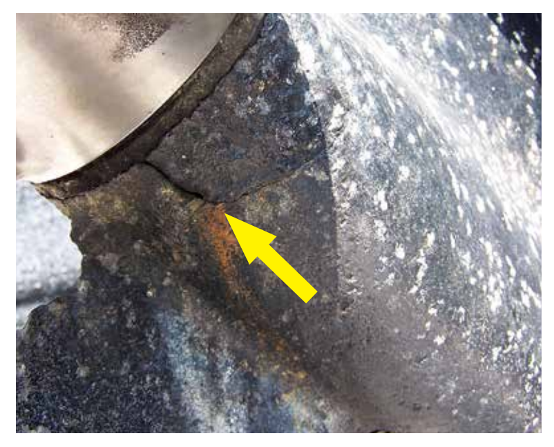
Store outdrives and outboards in the down position so water can drain; otherwise ice can crack the housing.

On all too many of our freeze claims the owner says, "But I thought the yard was going to take care of that!" Whatever you expect to be done, spell it out in writing.