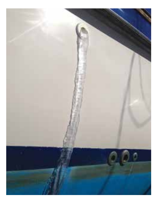
Frozen meltwater can damage thru-hull fittings.

ustom-made winter covers, typically canvas or synthetic, are a terrific benefit to your boat's gelcoat and general well-being. Some skippers mistakenly believe that biminis, which shield the crew from glaring sun, will also protect the boat from freezing rain and snow. Quite the contrary - expensive biminis tend to get ripped apart or age prematurely while doing nothing to protect the boat. Biminis should be stowed below, or better yet, taken home and cleaned over the winter. More frugal skippers seem to think that a few tarps stitched together with a spiderweb of lines qualify for winter duty. In the first serious storm, these end up shredded, and in their death throes they often deposit large amounts of snow and ice into the boat they are supposed to be protecting.