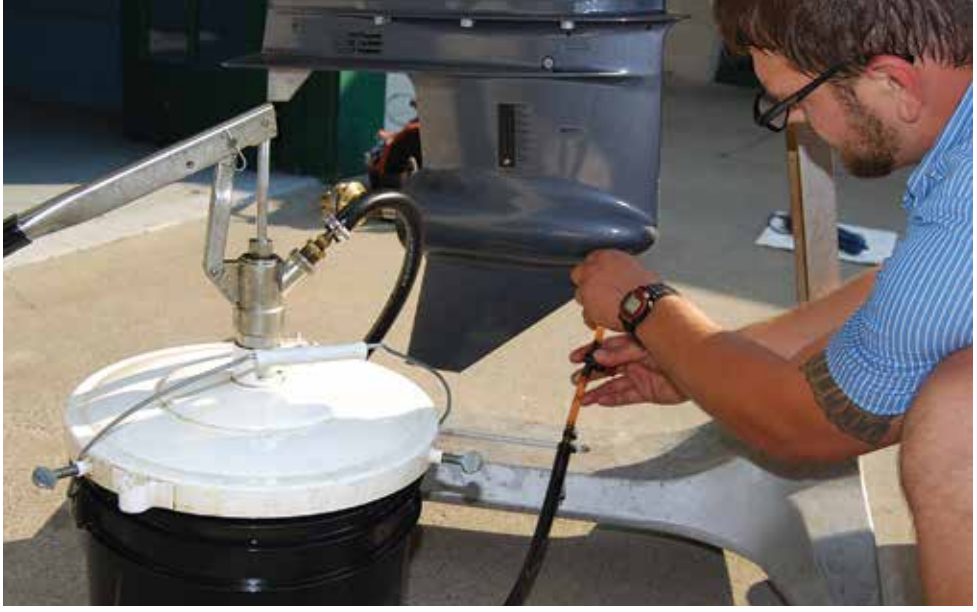
Changing the lower unit oil will help protect your boat from worn out lube over the winter.

After treating the fuel and running the engine for a few minutes, the engine should be "fogged" with a storage lubricant. This protects the internals (bearings, seals, and rotating surfaces) with a thin film of lubricant, which helps keep rust and corrosion away. With the engine running, inject fogging oil through the carburetors or electronic fuel injection (EFI) system air intakes in such a way as to "flood" the engine with oil until it begins to smoke, then continue fogging it until it stalls. Fogging can also be done with the engine shut down; in this case, the spark plugs are removed and the oil is sprayed into the cylinders, rotating the flywheel to distribute the oil. Store the engine in the running (tilted down) position; otherwise water that gets in through the hub can freeze and crack the lower unit housing. If possible, take smaller outboards home for safekeeping.