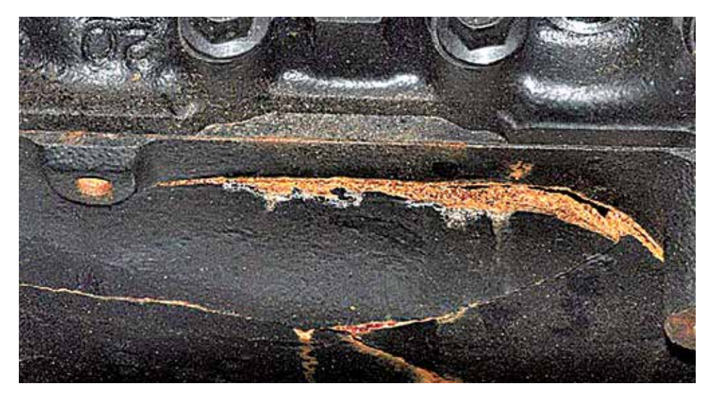
Water expands when it freezes and not properly winterizing your engine can lead to a cracked block, necessitating engine replacement.

Note that in raw-water-cooled engines a thermostat blocks water flow in some cooling passages until the engine heats up. To be thoroughly protected, raw-watercooled engines must reach operating temperature and the thermostat must be