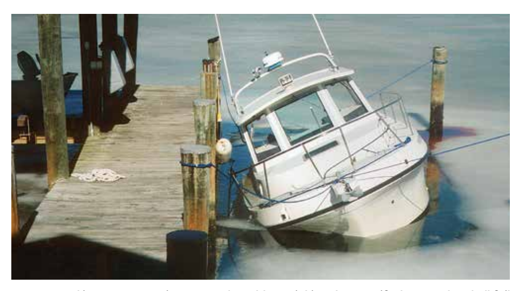
Boats stored in water over winter are vulnerable to sinking damage if a hose or thru-hull fails.

Storage ashore may also be less expensive over the life of a boat because a hull that