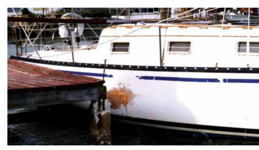
Thru-hulls and other

henever the boat is stored in the water, it's in a pitched battle to keep out all the water surrounding it, and that battle gets considerably more difficult when ice might damage a thru-hull or bilge pump, when the electricity might go out causing batteries to go flat, and when snow buildup in the cockpit might submerge above-waterline fittings. If you are going to leave it in the water, make sure you pay careful attention to the following areas as well as to your battery (see sidebar, page 4).