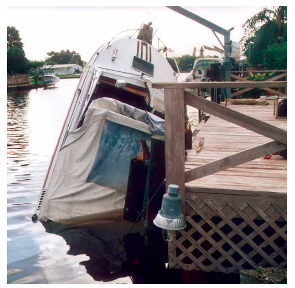
Rain or snow can make a boat too heavy for its lift.

Storage on lifts can be the best of both worlds, with most of the advantages of hardstand storage while still allowing you to use your boat when the weather is balmy. But the BoatU.S. Marine Insurance claim files show that lifts do not fare well in hurricanes and strong nor'easters. Wind, waves, and surge can shift the boat, and torrential rains or heavy snow can increase the boat weight to the point of breaking the lift. If you live in an area with strong winter storms, or if your lift is exposed to fetch from the direction of the prevailing storm winds, it's better to store your boat on its trailer. Otherwise, make sure the hull is properly supported and will drain efficiently, and inspect your lift wires, chains, and fittings carefully before tucking your boat in for the winter. A cover is even more important for a boat stored on a lift (see page 6 for more on covers). As with boats stored on the hard, the hull is exposed to the air, so make sure to winterize well before the freezing temperatures arrive. A