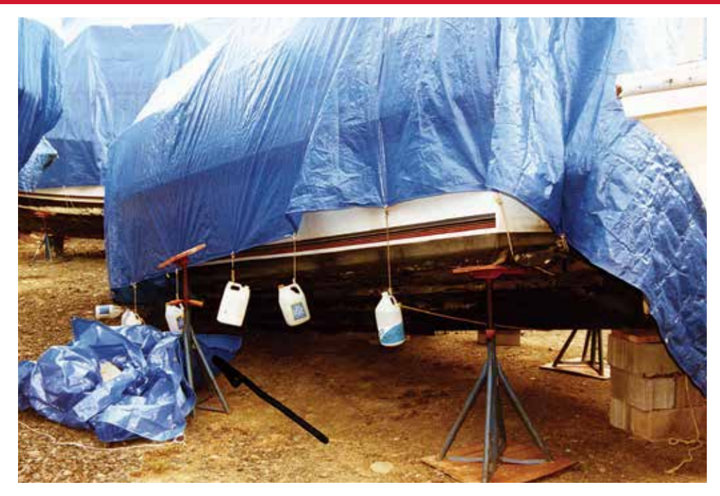
A boat stored ashore needs to be properly supported to make it through winter unscathed.

Jack stands should be placed as far out from the boat as practical to support the boat in high winds, with at least three per side for boats over 26 feet and additional supports at overhangs. The weight of the boat can easily force a jack stand base deep into mud, sand, or asphalt. Even clay that seems brick hard can become a quagmire in heavy spring rains, allowing stands to