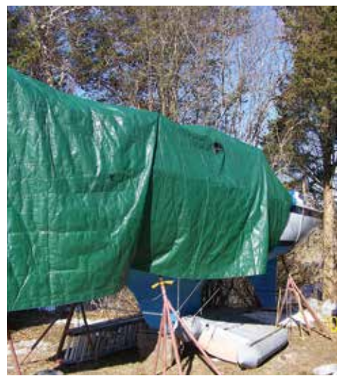
Plastic tarps typically will begin to shred after the first blow, leaving your boat unprotected.

Though shrinkwrapping is very effective at keeping rain and snow out, it will also trap moisture inside and create horrendous mildew problems if vents aren't used along the entire length of the cover. Another problem: Cabins and decks painted with two-part polyurethane paints may peel or bubble where the shrinkwrap touches it. Inserting a series of foam pads between the hull and cover allows condensation